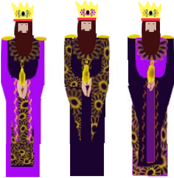
We three kings...